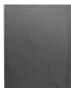
CARBON FIBER PANEL Part No.: CFSHEET10

Do-it-yourself projects are made easy with our pre-manufactured carbon fiber panels and pressed sheets. The carbon fiber panel offers high stiffness, while the single-layer carbon fiber sheets provide some flexibility for your projects. Both our panels and sheets are made from the same genuine carbon fiber material which we use in all of our products.