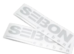
(Silver reflective) Part No.: DECALS

The original Seibon Carbon logo decals are perfect for any Seibon Carbon products, as well as windshield, side windows, or body parts display. Its size is approximately 10 inches by 2.25 inches, available in silver reflective and white, red color.