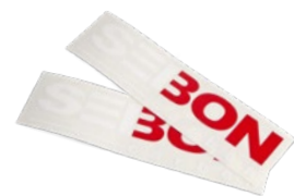
(Red, white) Part No.: DECALS-RW