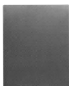
SINGLE-LAYER CARBON FIBER PRESSED SHEET Part No.: CFSHEET04

Dimensions: 400mm x 500mm (15 3/4" x 19 1/2") Thickness: 1mm (0.04") Surface: Double sided glossy, smooth finish