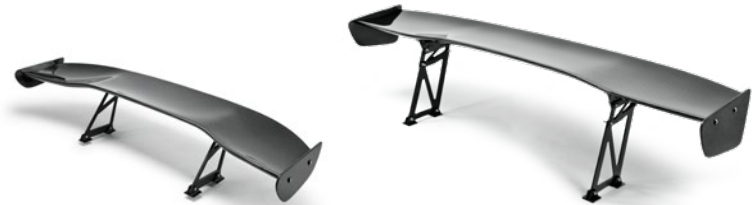
GT WING (Standard) Part No.: GTWING-1

The GT-Wing 180 is inspired by the GT wing, the universal GT-180 wing is wider and taller than its predecessor. Its span length of 70.5 inches and 16.25 inches height give it a powerful presence. A distance of 39.7 inches between each stand make this wing most appropriate for wide wheelbase vehicles.